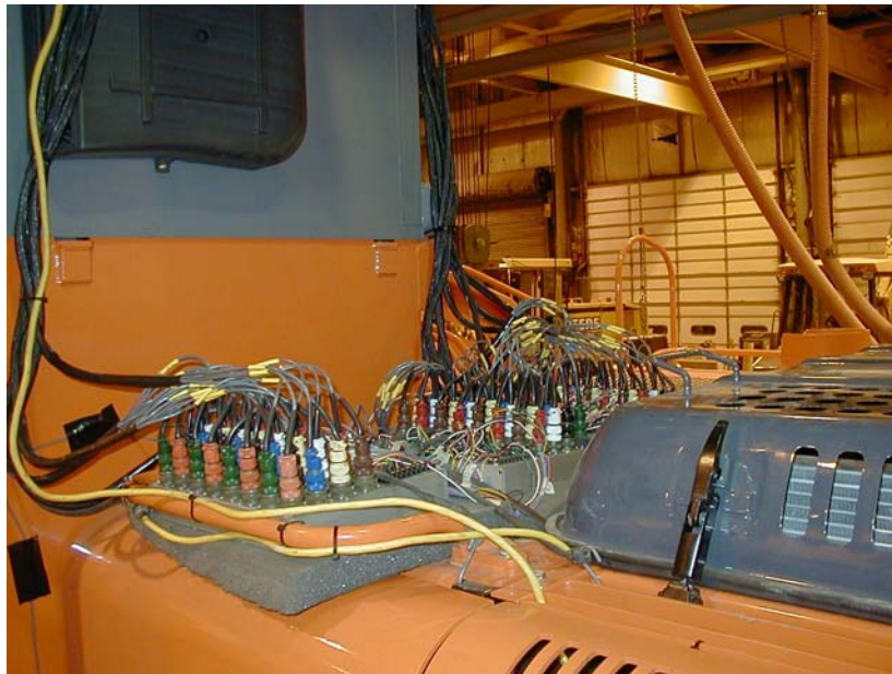
Typical Cabling Implementation for a 96-channel Application

To meet the data acquisition hardware/software and signal-conditioning requirements, the company uses products from DATAQ Instruments. John Deere engineers integrate these products with transducers and packaging suitable for the punishing environments where they will be used. They also combine in-house setup and translation programs with commercial analysis software to yield optimal final results.