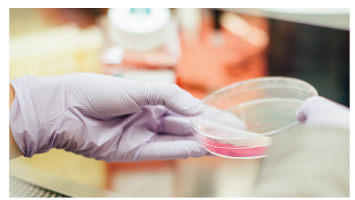
Bio-Pharma / Bio Technology