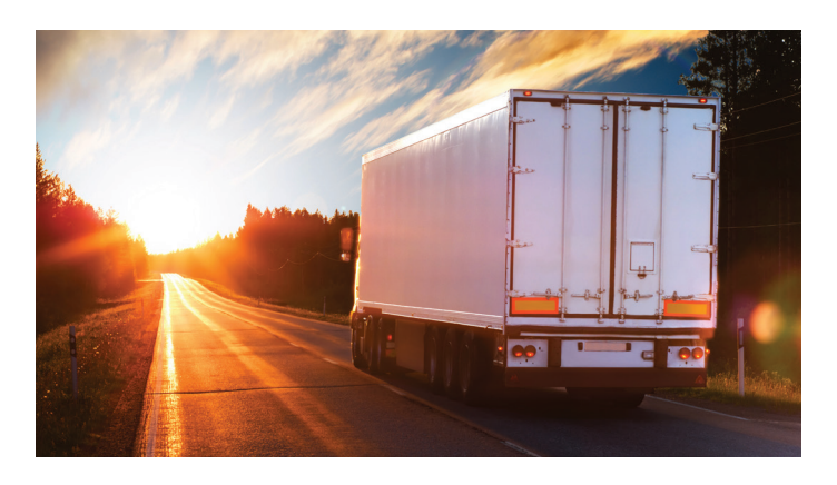
Bio Storage & logistics