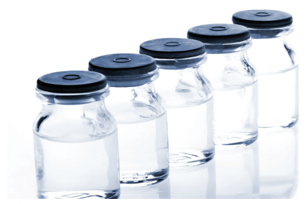
Pharmaceutical & Vaccines